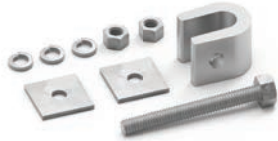
Lattice Tower Clamp Kit with 6" Long Bolt (Suffix Code: LTC1) (Catalog Number: LTC-1)