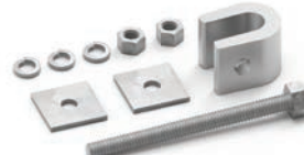
Lattice Tower Clamp Kit with 8" Long Bolt (Catalog Number: 7000402)