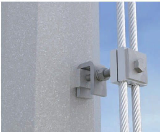
FIBERLIGN Aluminum Downlead Cushion for OPGW Mounted to Steel Pole with Metal Pole/Lattice Tower Clamp Kit