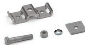
Banding Bracket Kit (Suffix Code: B1) (Catalog Number: 710010576)