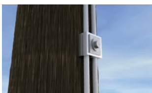
FIBERLIGN Aluminum Download Cushion for OPGW Mounted to Wood Pole (Suffix Code: H1)