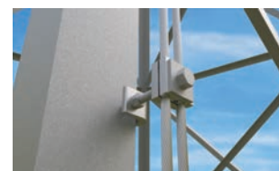
FIBERLIGN Aluminum Download Cushion for OPGW Mounted to Lattice Tower (Suffix Code: LTC1)