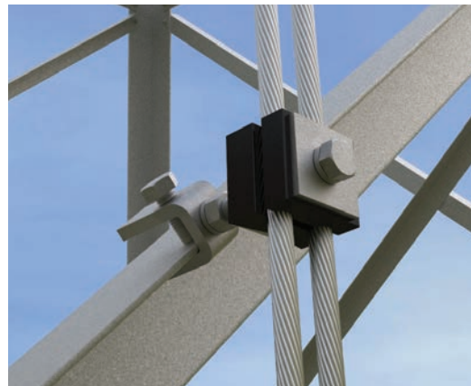
FIBERLIGN Urethane Downlead Cushion for OPGW Mounted to Steel Pole with Horizontal Metal Pole/Lattice Tower Clamp Kit