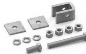
Horizontal Metal Pole/Lattice Tower Clamp Kit (Catalog Number: 710016505)