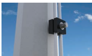
FIBERLIGN Urethane Download Cushion for OPGW Mounted to Steel Pole (Suffix Code: H3)