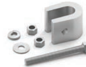
Light-Duty Lattice Tower Clamp Kit (Suffix Code: LTC2) (Catalog Number: LTC-2)