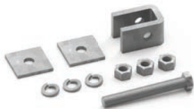
Metal Pole/Lattice Tower Clamp Kit (Catalog Number: 710015838)